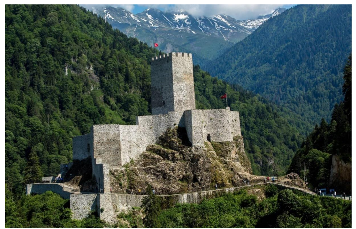
Plate 3: Zil Castle south of Rize, north-east Türkiye (rize.goturkiye.com/see)

Zil castle is located 15 km south of Rize, on the slopes of the Firtina River. The castle was built 100 m above the stream bed and comprises outer walls, middle walls and an inner citadel (Plate 3). The castle provided security for the region and the important medieval caravan route southeast to İspir. The castle was also used after the conquest of the Ottomans. The castle has undergone recent restoration (rize.goturkiye.com/see).