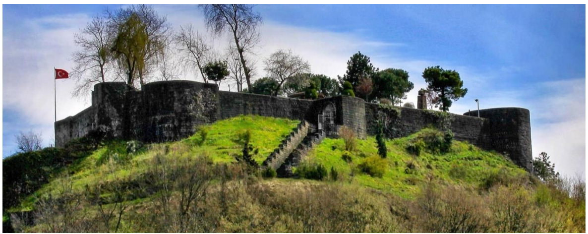
Plate 2: Rize Castle, north-east Türkiye (rize.goturkiye.com/see)