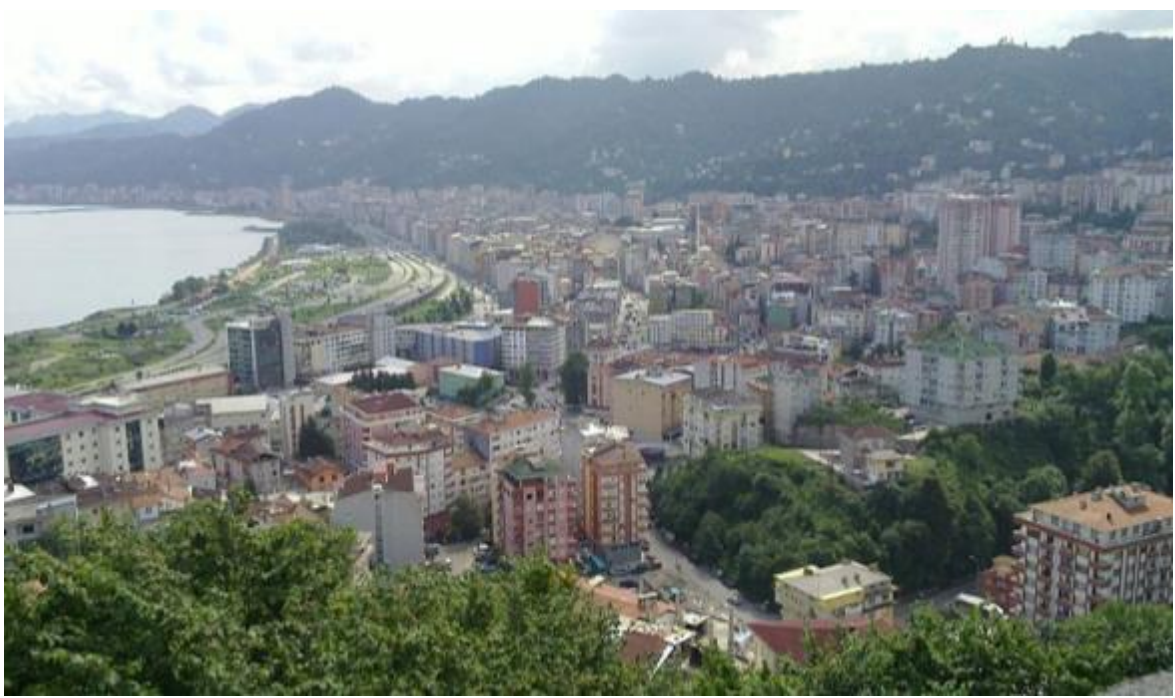
Plate 1: Rize on the Black Sea coast, north-east Türkiye, 2014

Rize is built on a narrow strip of flat land between the sea and the mountains. Rize's university was founded in 2006 and has 15,000 students (Turna 2015).