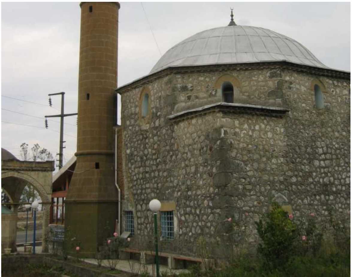
Plate 5: İslampaşa Mosque, Rize (kulturportali.gov.tr/turkiye/rize/gezilecekyer/kursunlu-camii-slampasacamii)

The İslampaşa Mosque was built in 1571 using rubble stone. It is located in the Rize town centre (Plate 5) and is surrounded by a cemetery (kulturportali.gov.tr/turkiye/rize/gezilecekyer/kursunlu-camii-slampasa-camii).