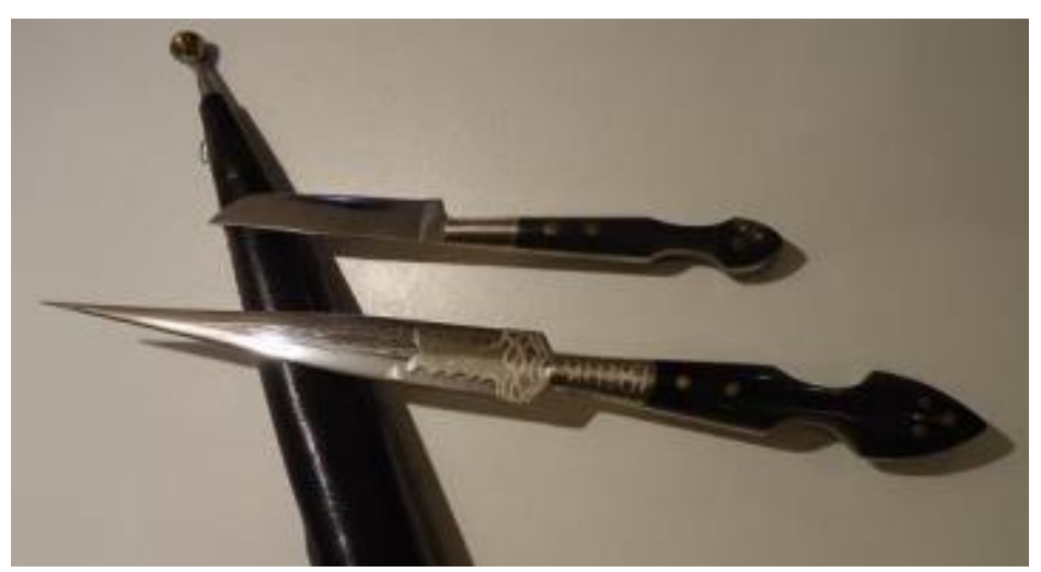
Plate 5: Sürmene knives

Sürmene was renowned as a centre of knife making, especially the ornamental daggers worn by men with traditional dress (Plate 5) (Republic of Turkey Ministry of Culture and Tourism 2011). The Sürmene knife is an ethnographic artefact with its construction, design, decorations and scabbard. They are known for their durability and sharpness. The knife, which has a length of approximately 20 cm, is produced in various models (Güdü Demirbulat and Özgürel 2024).