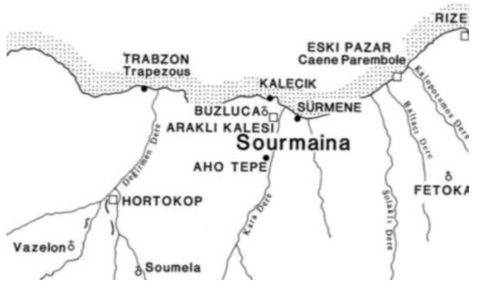
Fig. 1: Trabzon to Rize, Black Sea coast in north-east Türkiye, (Trabzon to Sürmene = 35 km, Crow and Bryer (1997:285))

The kingdom of Mithradates VI which encompassed Pontos and other areas around the southern, eastern and north-eastern Black Sea area was eventually absorbed within the Roman empire. Then it became part of the Eastern Roman (Byzantine) empire.