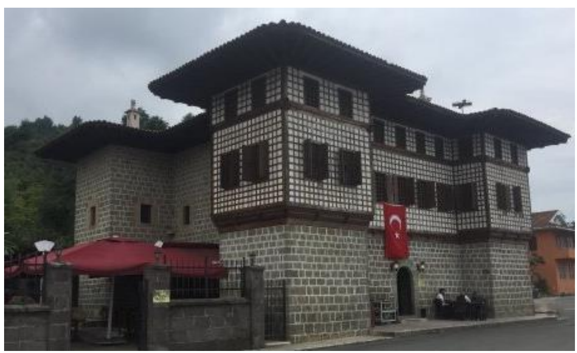
Plate 4: Memisaga mansion, east of Sürmene (www.tripadvisor.com.tr/Restaurant_Review-g2187663-d12612732-Reviews-Memis_Aga_Konagl-Surmene_Turkish_Black_Sea_Coast.html)