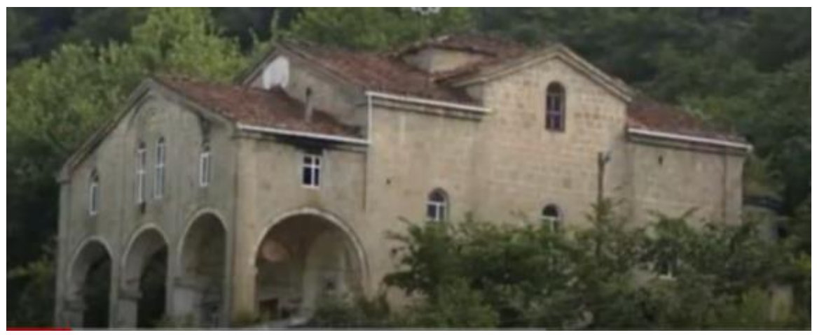
Plate 2: Former Greek church Timiou Stavrou now a mosque, Dirlik, south of Sürmene (2023, www.youtube.com/watch?v=7-mC1FF5EHk)