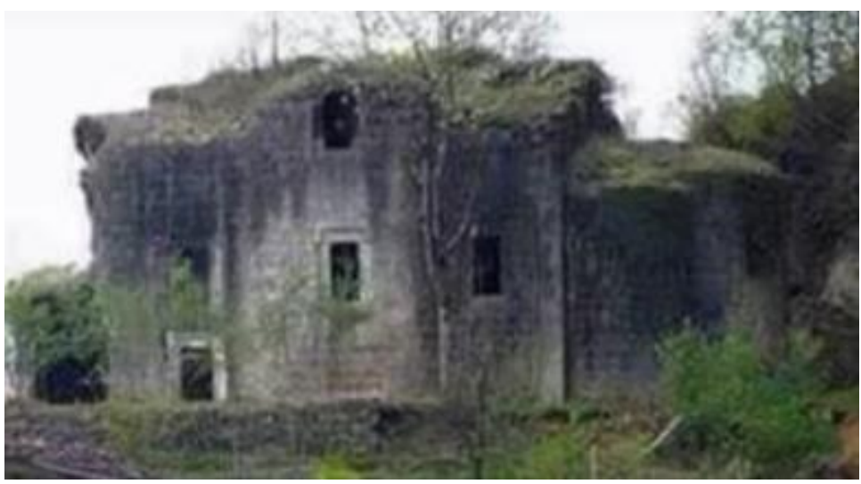
Plate 3: Former Greek Church of the Metamorphosis, Dirlik, south of Sürmene (2023, www.youtube.com/watch?v=bY8_ZZo-6aQ)