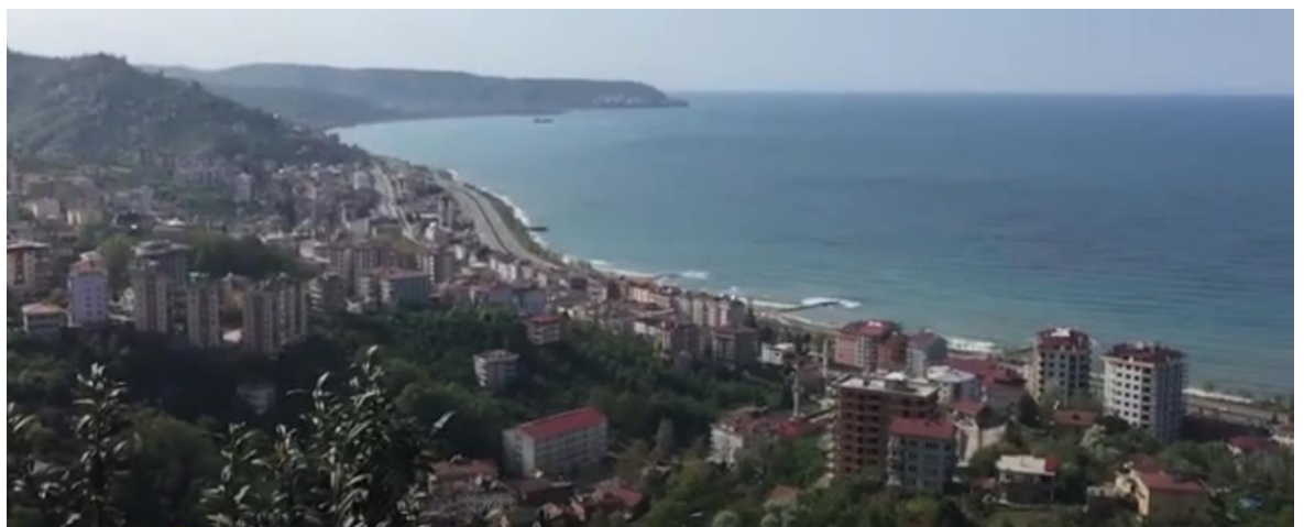
Plate 1: Sürmene, Black Sea coast, north-east Türkiye (2018, www.youtube.com/watch?v=j_lgl3whw9c)

Sürmene is a town on the Black Sea coast in north-east Türkiye (Pontos), 40 km east by road of Trabzon (Plate 1, Fig. 1). The population of Sürmene is estimated at 26,000 (2022). It experiences an increase in summer due to the influx of tourists. The main industries of the region are fishing, agriculture and tourism (due to its natural beauty) (Ismail et al. 2023). The Manahoz River runs north 30 km to the Black Sea at Sürmene. Sürmene had a continuous Greek history until 1923 (Bryer et al. 1972–1973). The area has a peculiarity in that some Muslim Turks in some of the surrounding villages still speak Romeyka , an old Greek dialect.